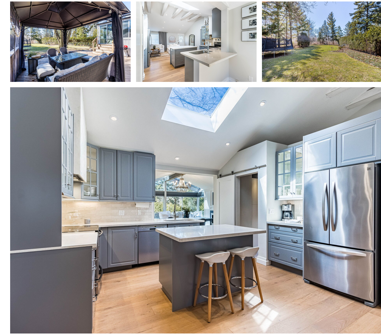
1'350,000.00 $1 - 480 ELWOOD ROAD, BURLINGTON, ON L7N 3C7