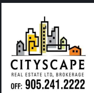
CITYSCAPE REAL ESTATE LTD., BROKERAGE