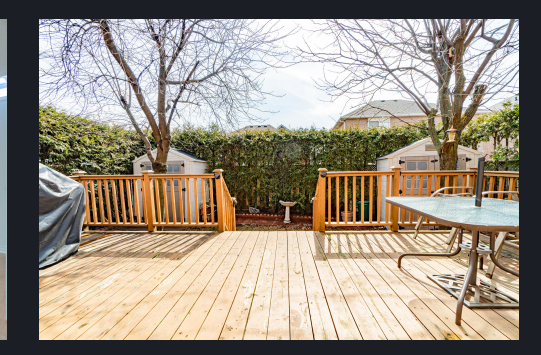
$845,000 - 8 BEAVERHALL ROAD, BRAMPTON, ON L6X 4L4

FOR MORE INFORMATION CALL (905) 497-4971